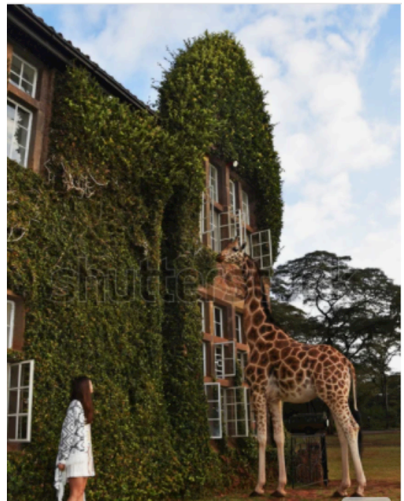
Giraffe Manor - you've probably seen it on TV.

We've already met most of The Big-5 ... no, the giraffe isn't among them, but it is the tallest animal we'll meet. ... and we will meet MANY of them!