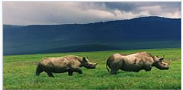
Black rhinoceros ( Diceros bicornis )

The black rhinoceros is a large herbivore having two upright horns on the nasal bridge. Its thick protective skin, formed from layers of collagen positioned in a lattice structure, is very hard to puncture. It is now critically endangered and hunting is extremely limited due to this. In the context